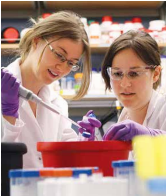
Students pursue research with Alumnae support.