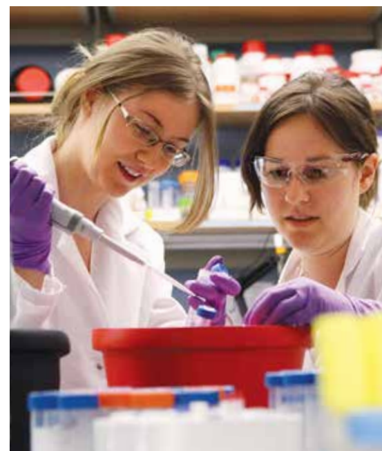
Students pursue research with Alumnae support.